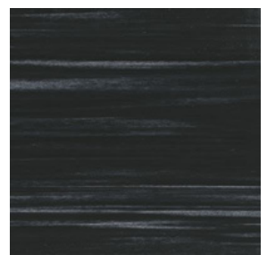
ARMT3631231 JET STREAM BLACK