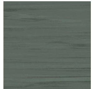
ARMT3623231 GREEN LEAF