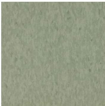
ARMT3520031 MOSS GREEN