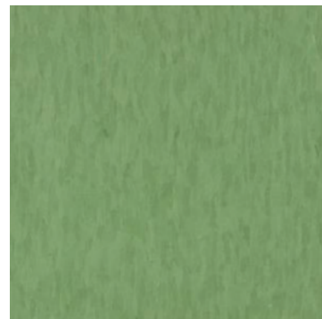
ARMT3527031 GREEN GRASS