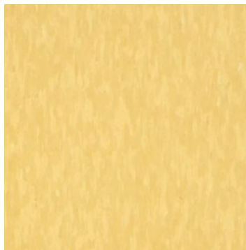
ARMT3522031 LEMON SQUEEZE