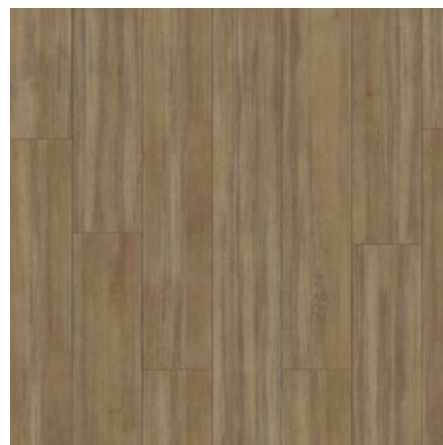
FAP 6007KR1 / 8007KR120 WHISPER