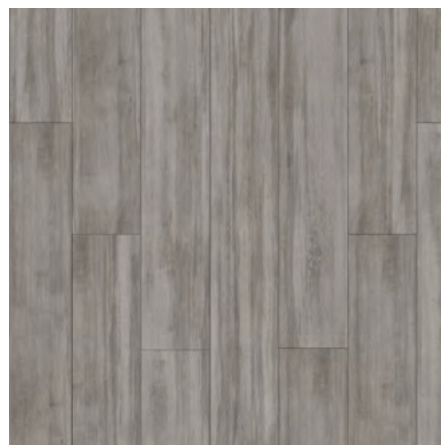
FAP 6006KR1 / 8006KR120 SLATE