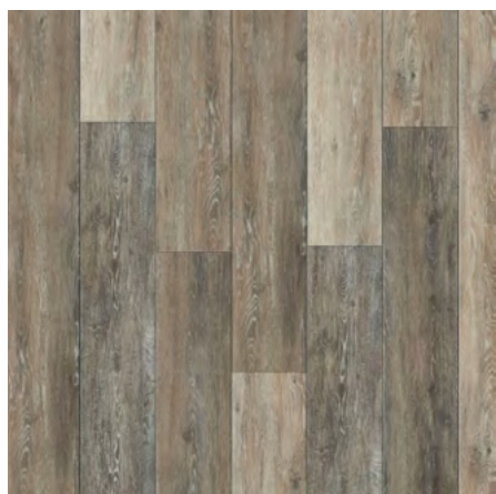
FAP 6002KR1 / 8002KR120 STORMY