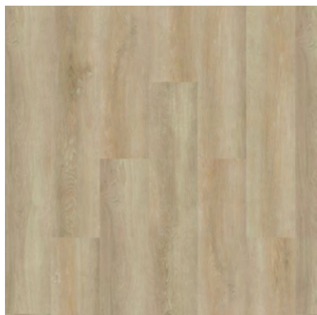
FAP 6015KR1 / 8015KR120 OAKESDALE