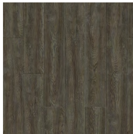
FAP 6000KR1 / 8000KR120 GRAVEL

FORMATIONS ACOUSTX ALPINE G-CORE COLLECTION