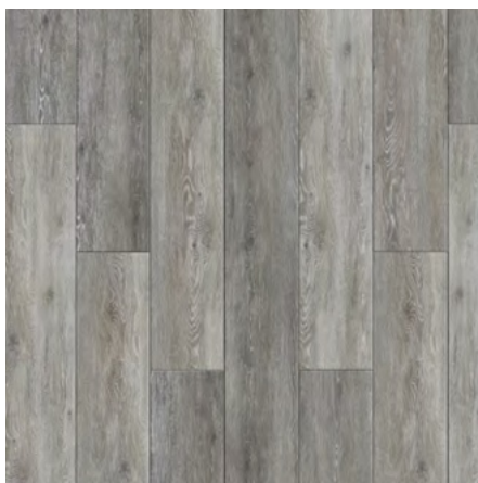
FAP 6003KR1 / 8003KR120 SEASIDE