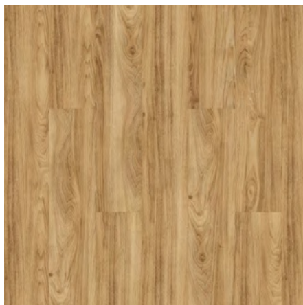
FAP 6012KR1 / 8012KR120 TOWN HALL