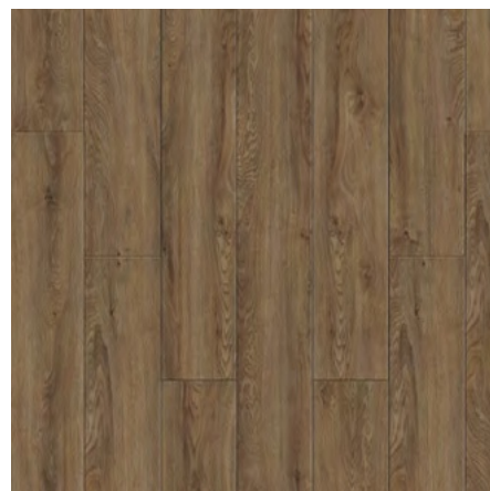
FAP 6004KR1 / 8004KR120 NATURAL