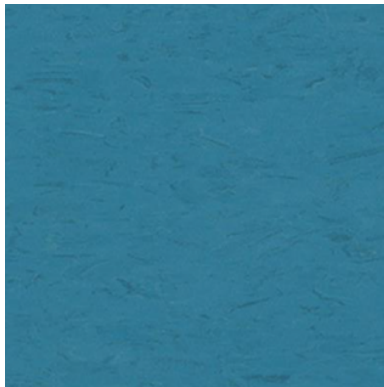
TAR1238 OCEAN TIDE