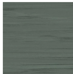
ARMT3623231 GREEN LEAF