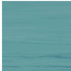
ARMT3632231 CARIBBEAN SEA