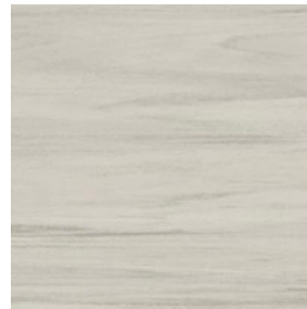
ARMT3633231 GRAY SKY