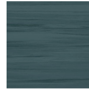
ARMT3621231 EMERALD CITY