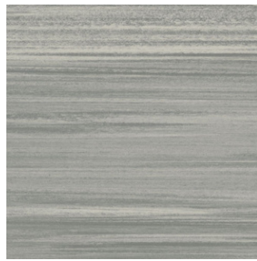
ARMT3608231 WARM GRAY