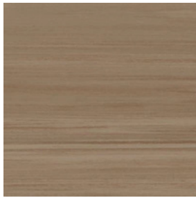
ARMT3616231 TEA TIME