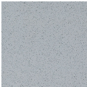
ARM52126031 GRAVEL BLUE