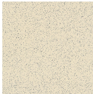
ARM52139031 LIMESTONE BEIGE