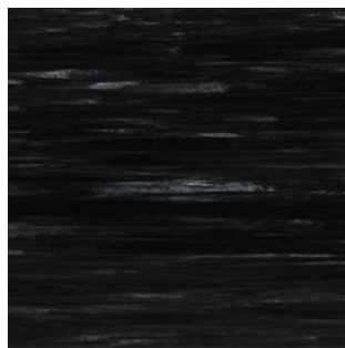
ARM55928231 WINTER SOLSTICE