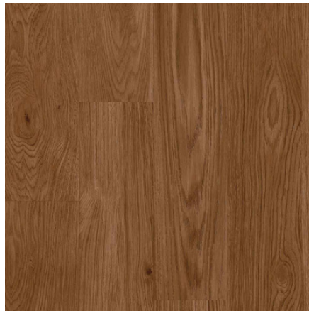
SAFFRON (6 FT) ARM80877201